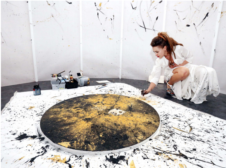
French performance artist Mila Lights, surrounded by hanji, draws a painting during her live art performance titled "Light Your World," at the Shilla Hotel in Seoul, May 23.